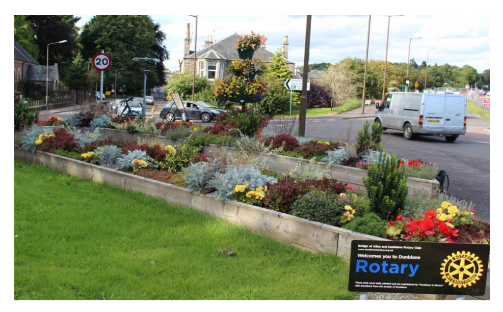
Raised beds opposite M & S