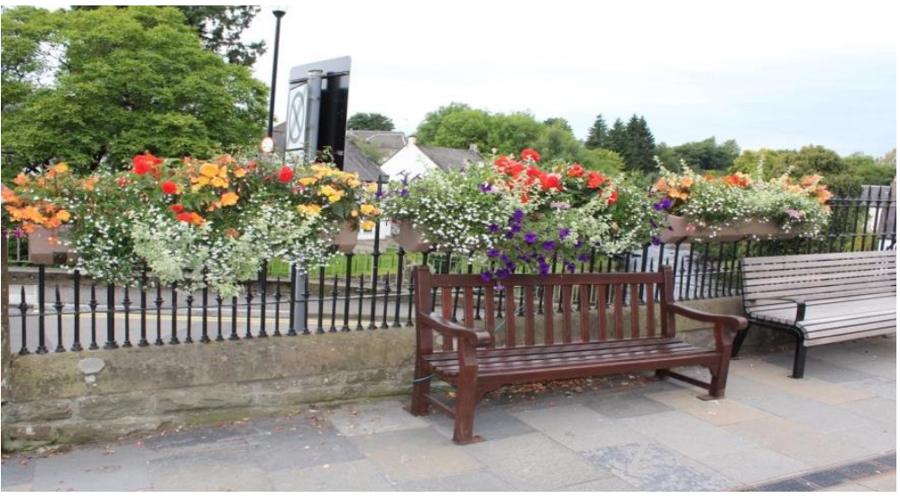
On the High St opposite the "Riverside"