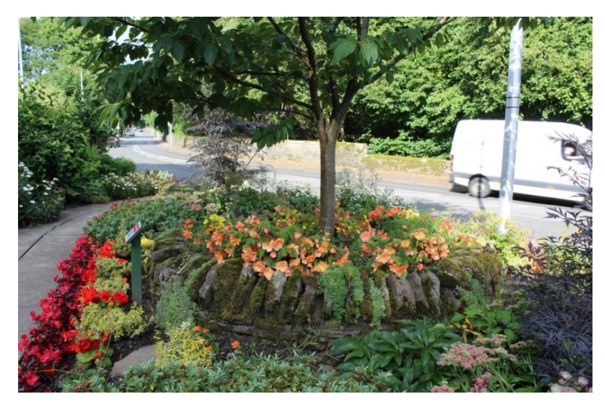
At the end of Smithy Loan