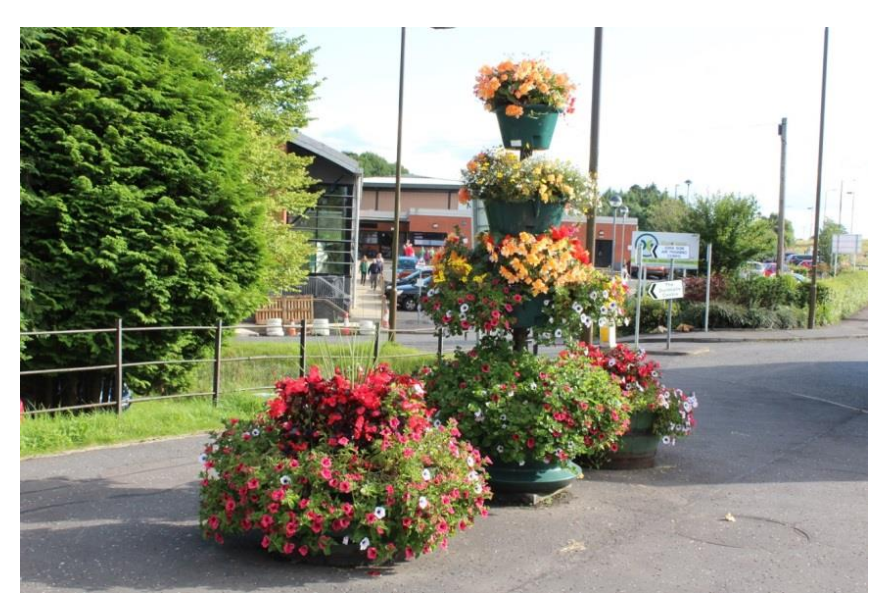
On the Perth Road dual carriageway