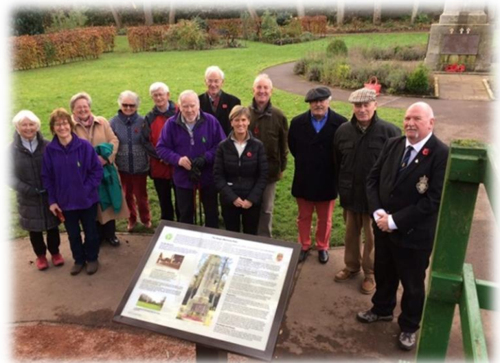
Memorial Park interpretation board installation