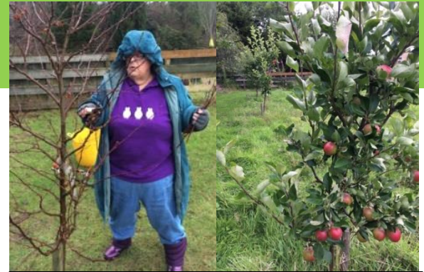
Community orchard at Dunblane Primary School: first fruit 2017