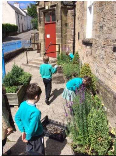
Planting Spring bulbs at the Braeport.