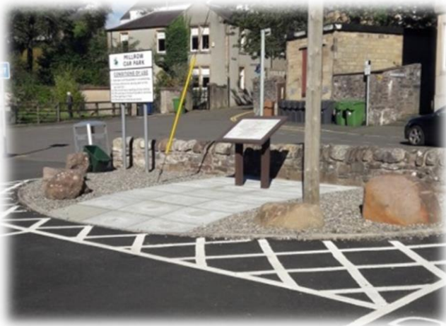
Welcome map at Mill Row car park