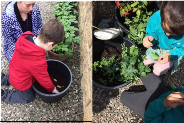
St Mary's Primary children planting potatoes and harvesting peas