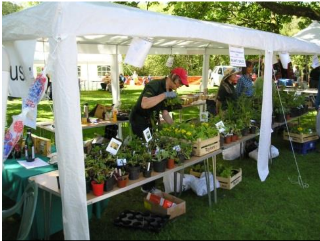
Annual stall at the Fling