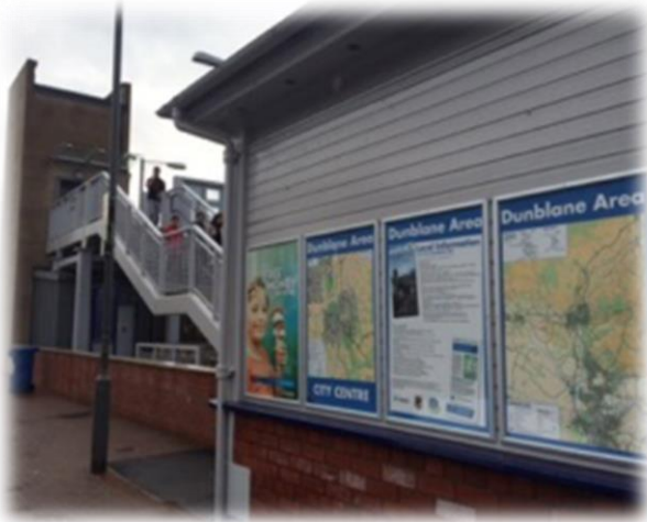
Green Travel Map at the station