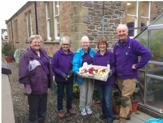
Onion and garlic crop