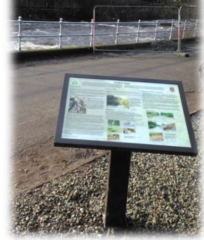
Interpretation boards on each side of the river