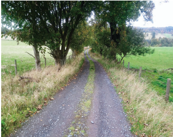
Track near Park of Keir