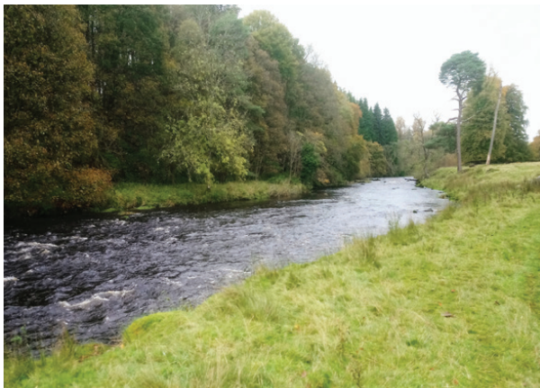
Allan Water near Kippenross House