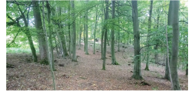
Path on Gallow Hill

2 The footpath climbs Gallow Hill. Keep left at the fork 200m further on. After crossing an old wall the path goes slightly right and gets fainter and generally keeps near the field to the right of the wood. The path comes out of the wood at a junction. Go straight ahead, downhill until the track takes a sharp right turn: at this point go through the field gate on the left and follow the track to reach the dual carriageway.