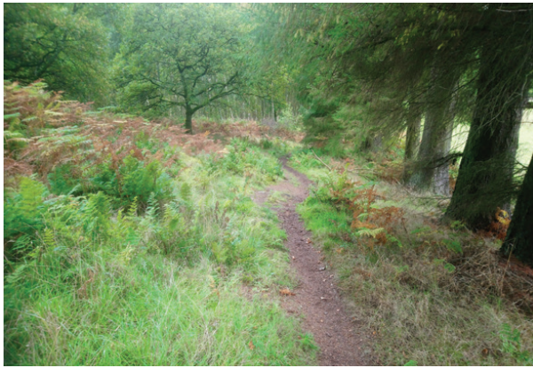
Path near Bridge of Allan